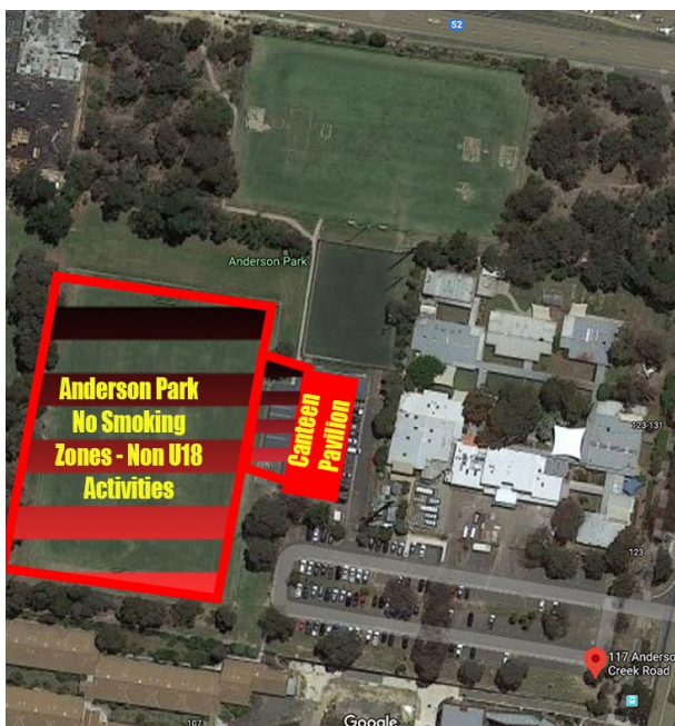
Figure 2: Anderson Park - No Smoking Zones for 18y.o. and over activities

According to the Football Victoria Rules of Competition, there is to be no smoking on the field of play.